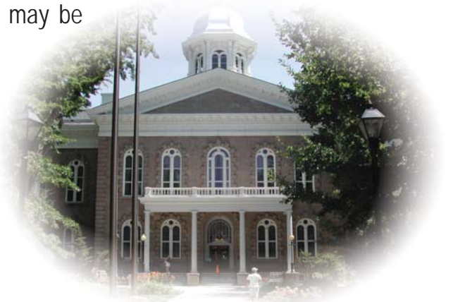
Nevada State Capitol Building in Carson City.

If a bill is introduced by an Assembly member, then the bill's house of origin is the Assembly. If the bill was introduced in the Senate, the house of origin is the Senate.